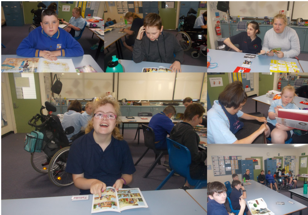
ROOM 17 HAVING A GREAT LITERACY PROGRAM