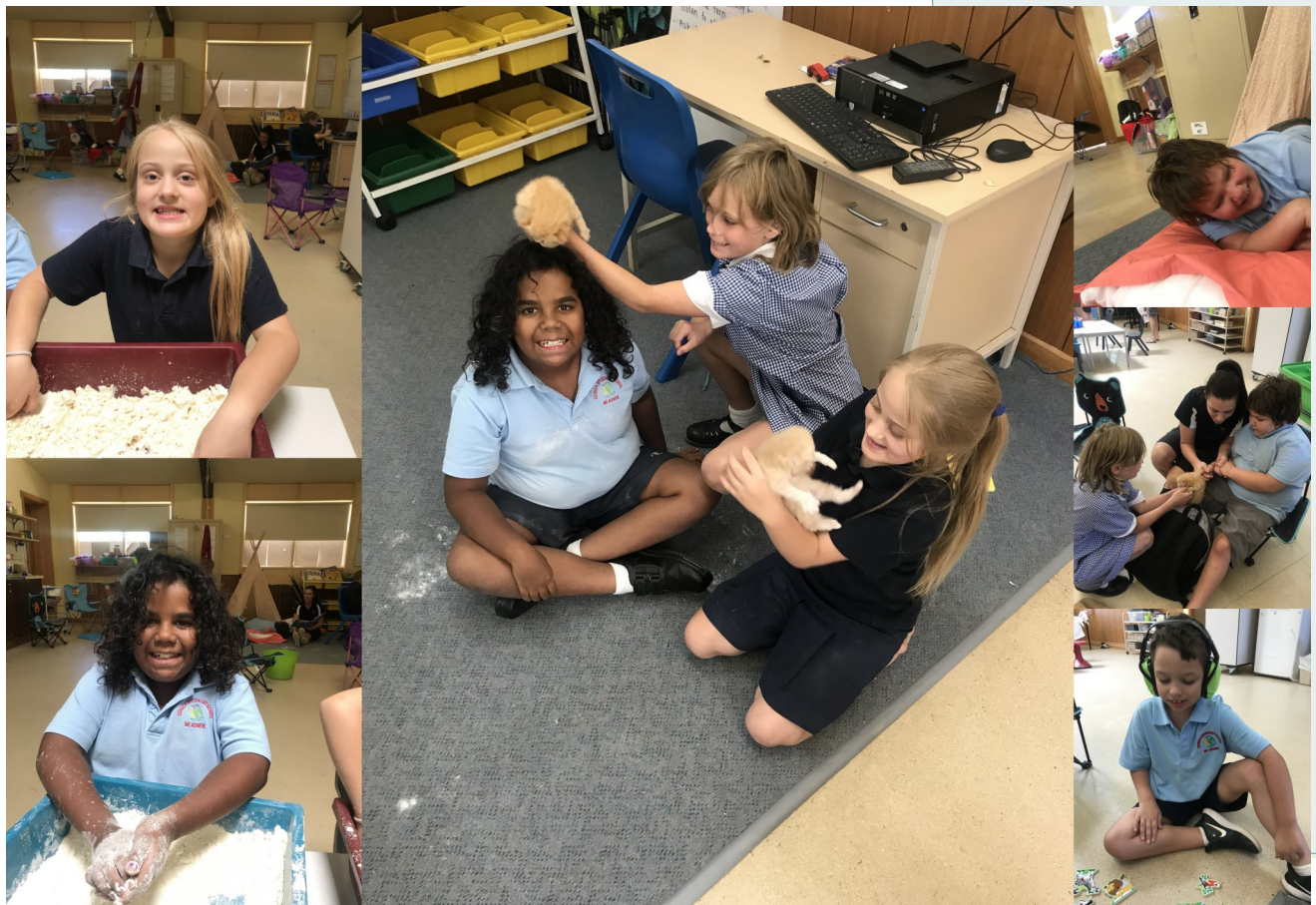
ROOM 5 STARTED THE YEAR WITH A VISIT FROM SOME VERY FLUFFY FRIENDS.